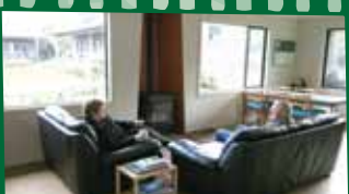
From left to right: Hector's dolphin at Port Craig, Edwin Burn Viaduct. Relics at Port Craig, lounge at Port Craig.