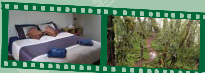
Above Left: Room upgrades available on request.