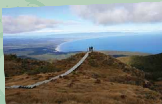
Te Waeose Bay below the Hump Ridge lookout