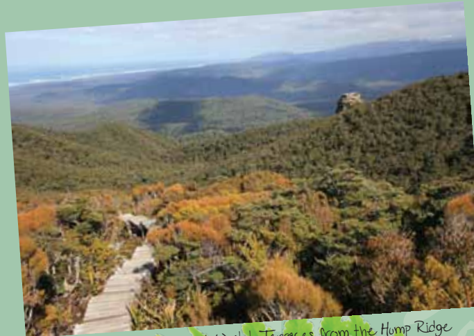
View of world renowned Waitutu Terraces from the Hump Ridge

You will absorb our local guides extensive knowledge and anecdotes of surrounding rainforests, birdlife, geology and local history.