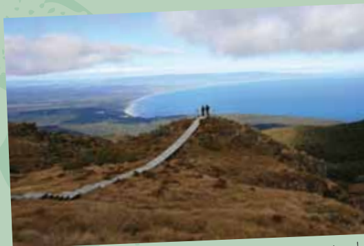
Te Waeose Bay below the Hump Ridge lookout