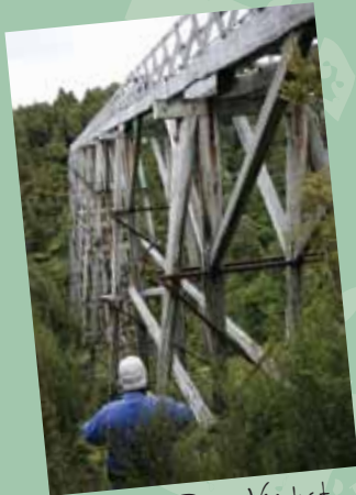
Pery Burn Viaduct

We are confident it will be one of those treasured memories which make you smile when you are telling friends and family of your adventures.