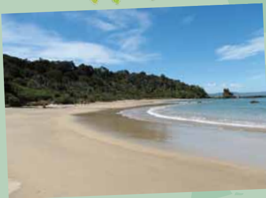
Blowholes Beach, day three