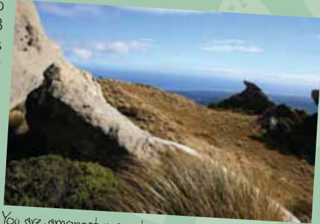
You are amongst many tors and ferns walking along our Okaka loop track at the top of the Hump Ridge

The Tuatapere Hump Ridge Track winds 53 kilometers across some of New Zealand's wildest land, leading walkers through the pristine Fiordland National Park, over private and Maori land, until it meets with our southern ocean.